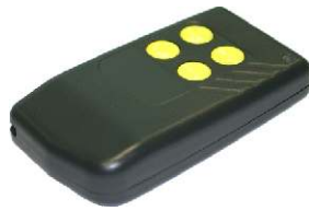
650200801 mod.TX-4M-5026 SAW433